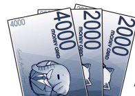
Money Cards in your hand

When the winning bidder receives the item, open the next Item Card from the deck and move on to a next auction.